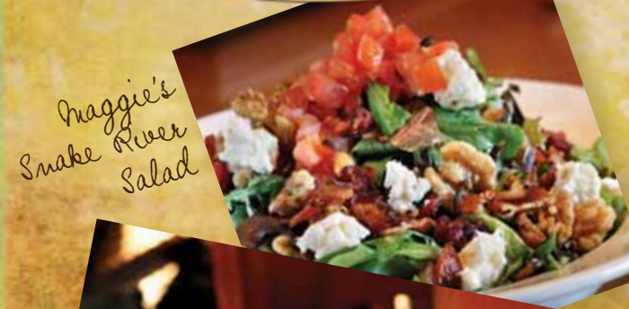
Maggie's Snake River Salad