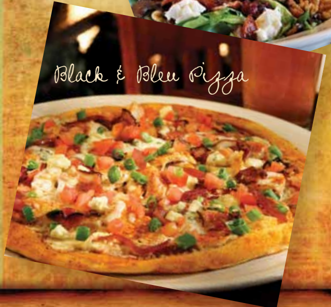
Black & Bleu Pizza